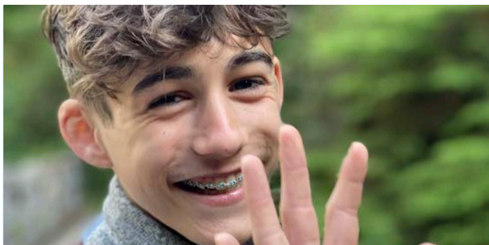
MOUNTAIN QUEST: Coming of Age

"From the Bogachiel River trail to the coast of the Pacific, me and my group hiked, and learned about each other, the environment and ourselves. This is a learning experience every kid should get to have. This journey has changed my life. "