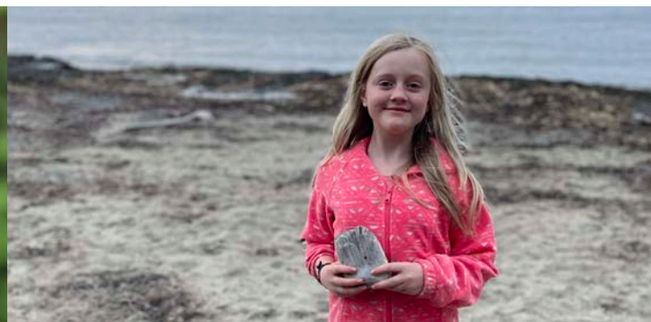
CALL TO ADVENTURE

"From the Bogachiel River trail to the coast of the Pacific, me and my group hiked, and learned about each other, the environment and ourselves. This is a learning experience every kid should get to have. This journey has changed my life. "